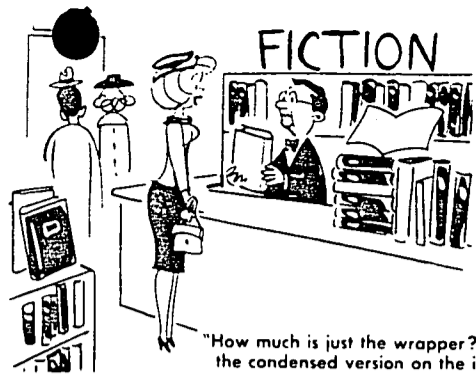
"How much is just the wrapper? I only read the condensed version on the inside folds"

JOHN GAY 1/30 RAYMOND KHOURY 2/03 WAYNE CLARK 2/01 DON REHMEYER 03 TIM RAINEY 02 FLOYD BOZE 07 OWEN MORRIS 03